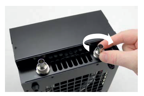
Fittings on Front of HXM

Install the shorter fittings included with the RPM module onto its rear inlet and outlet. These should be finger-tightened. (This is a parallel thread, do not use plumber's tape.)