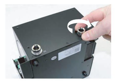
Fittings on Rear of RPM

If you have purchased both RPM and HXM modules, they are combined together using hardware included with those products.