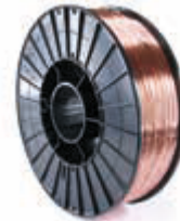
S602116 TG10 + S604

Attention: S602-74 TG10 can only be used with plastic coils with: Internal hole: \varnothing 53 mm Width: 55 mm